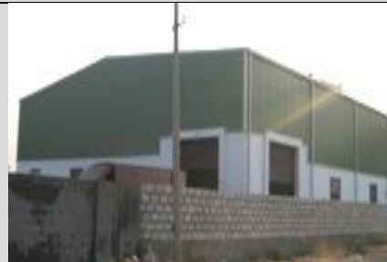
Warehouse from the outside