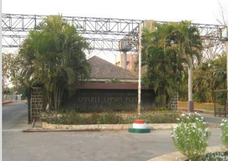
Main gate to Apparel Export Park