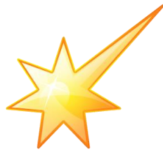
10 years Service Award !