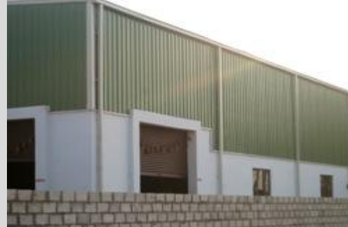
Warehouse from the outside