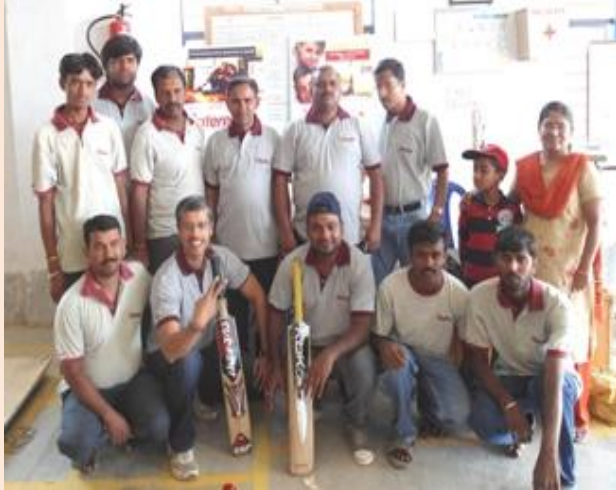
Office Staff Cricket Team-

“Way to go” To the winners, Operations Team-Bangalore!