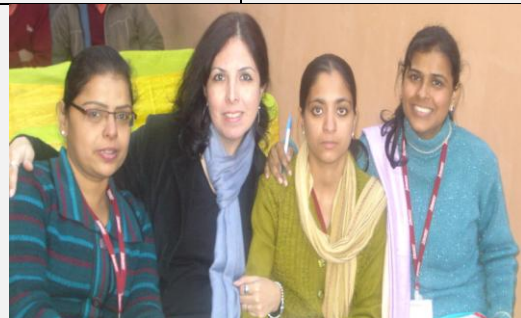
The Women of Gurgaon office