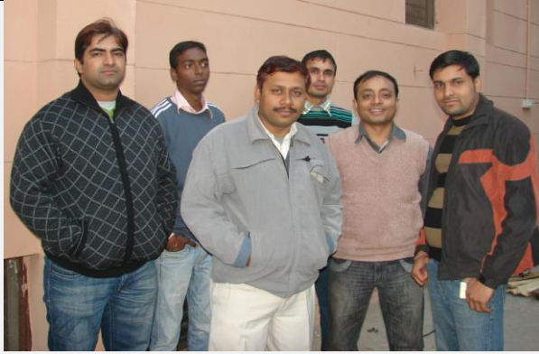
The Men of Gurgaon office Waiting for the food