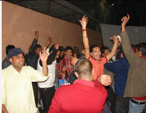
The workers Dancing the night away