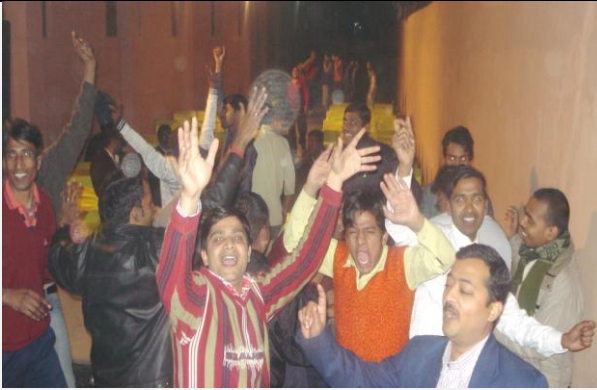
The workers Overjoyed